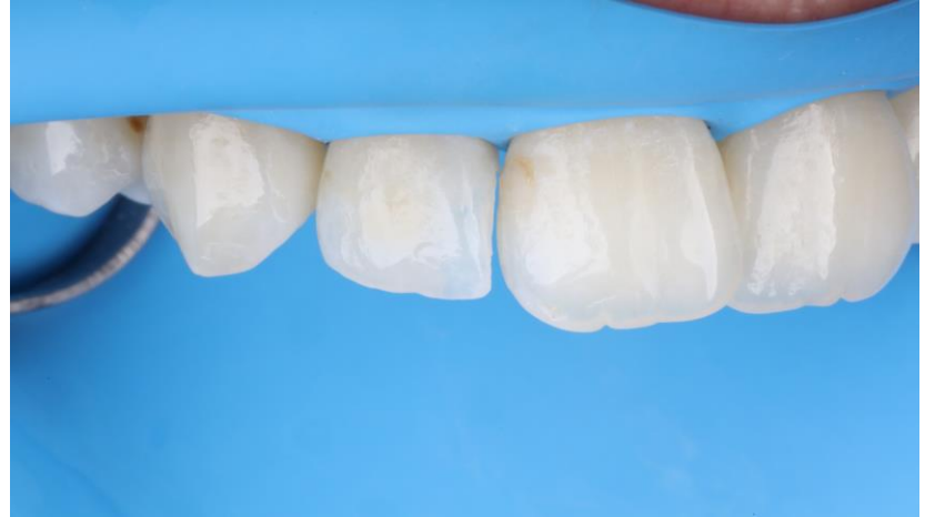
The quadrant under isolation with a rubber dam.