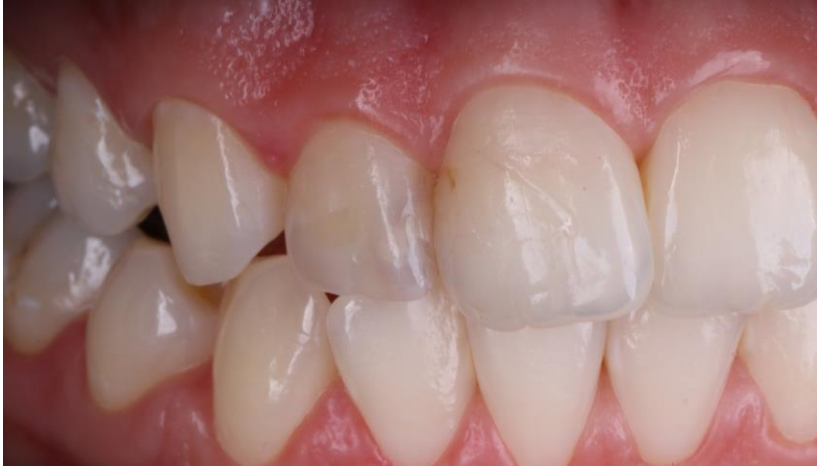
Preoperative view of the carious lesion on lateral incisor 12.