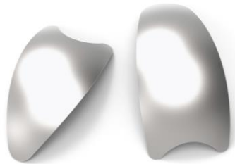
Unica proximal anterior matrices

The Polydentia products used in this clinical case are: