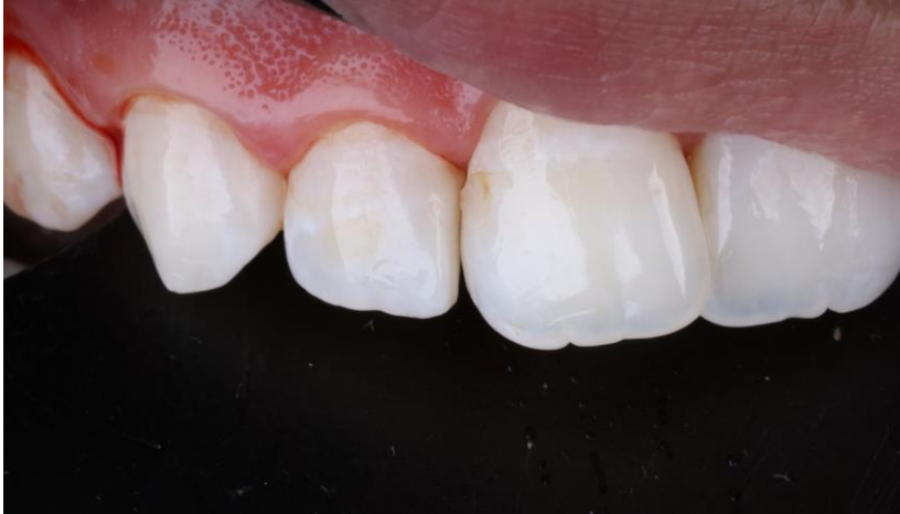
Immediate postoperative images after rubber dam removal.